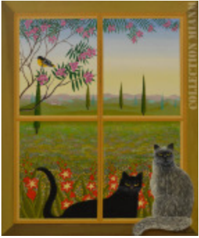
Empêchement (L) (2005.070)